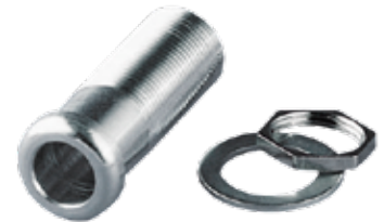
TE Table Bushing