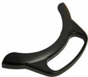
KFM LED Handles