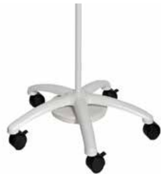
Floor Stand (Trolley) With Extra Weight