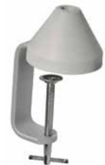
AH Mount Bracket