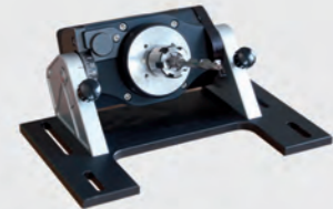
Real3D Rotation Unit G2